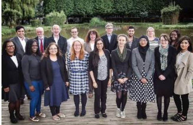
LAPG required a photo of CLP staff very quickly so here are those staff who were available at the time and apologies to the other staff members who were not available

CLP have been shortlisted in the Legal Aid firm/not for profit agency category of the awards. For more details see:- http://www.lapg.co.uk/wp-content/uploads/LALY-2017-finalists-press-release-.pdf .